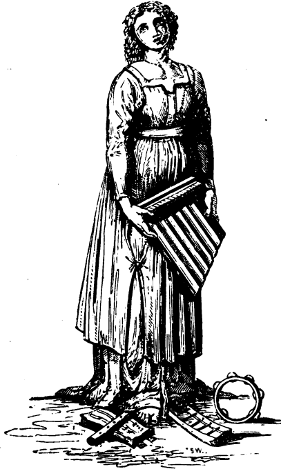
S. Cecilia ( Raphael ).

together most happily, trying to teach others and to succour and console such of their Christian neighbours as suffered for their devotion. The usual fate overtook them—being